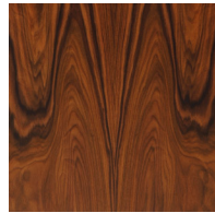
SR: Santos Rosewood, Oiled and Waxed