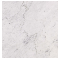
CRM: Carrara Marble