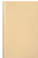
NRB: Natural Rubbed Bronze