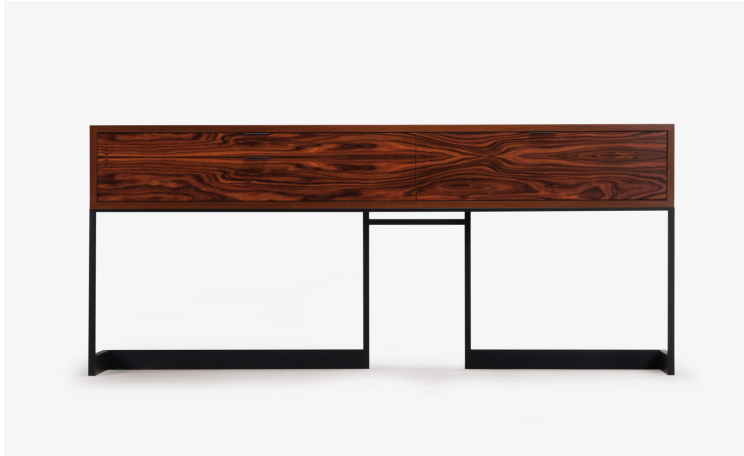
wishbone container-sideboard W47