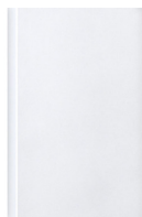
MOW: Matte Opaque White