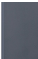
MOC: Matte Opaque Charcoal