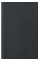
MOB: Matte Opaque Black