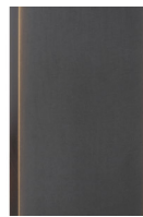
DRB: Dark Rubbed Bronze