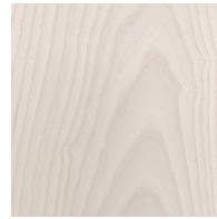
WA-WW: White Ash, Whitewashed