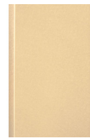
NRB: Natural Rubbed Bronze