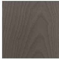
WA-G: White Ash, Grey