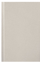
SS4: Brushed Stainless Steel