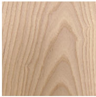
WA-N: White Ash, Natural