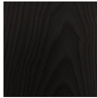
WA-E: White Ash, Ebonized